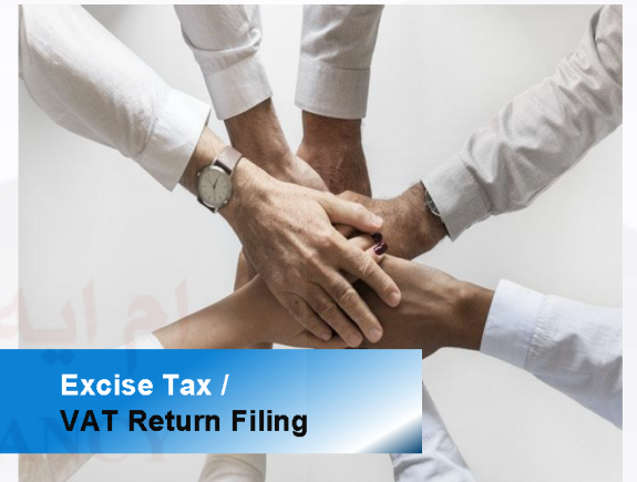
Excise Tax / VAT Return Filing

Based on the data obtained from the customer, the tax returns are submitted on behalf of the business by the deadlines. The right advice on how to pay the least amount of tax due in accordance with the Law's requirements will be given.